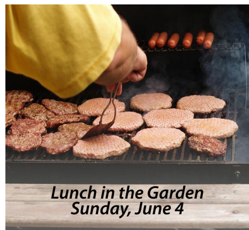
Lunch in the Garden Sunday, June 4

This summer we are adding another dimension to our fellowship events with one each month. We are calling them SUPER SUMMER SUNDAYS. The first one is Sunday, June 4, following worship, "LUNCH IN THE GARDEN". The Prayer Garden Team will host lunch for everyone in our Fellowship Prayer Garden. This will be a fun fellowship luncheon. You will enjoy that beautiful area of our church property. The garden is always peaceful and wonderful. Golf carts will be available if you prefer transportation. This cookout of hot dogs and hamburgers will be great fun. Come and enjoy the beautiful nature and beautiful garden for our first SUPER SUMMER SUNDAY!